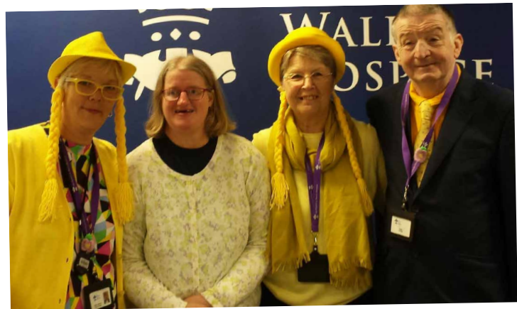
Winners - Doncaster shop